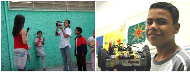
Figure 2. Various media employed in the workshop.

up with others who loved robotics to make their projects come to life. In the process, the first group also became interested in technology. Unusual “entry-points” also came about. For instance, one student was very shy in the beginning and never engaged for more than ten minutes in any activity. However, she liked the video camera, and started to document other students’ work. In this process, she became proficient and self-confident and decided to make video documentaries of problems in her community. Then, inspired by these successful documentary projects, other students became engrossed in the idea of designing robotics devices to help solve neighborhood problems. The presence of those objects and tools, which were simultaneously available, “mobile”, and had to be shared, created new dynamics that are very rare in regular classrooms, where content is mediated symbolically—on paper—and where there is little if any opportunity to develop democratic control.